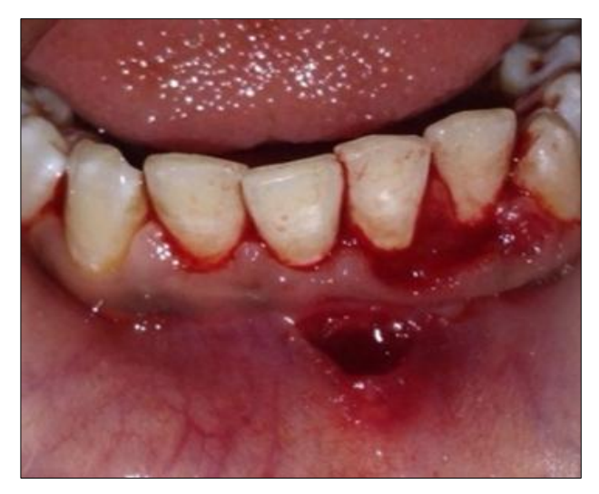
Figure 3- Intra operative