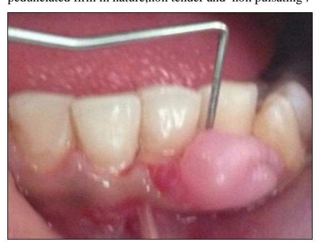
Figure 1- Pre operative

The overlying mucosa was found to be normal in color and showed no vascular markings. The mass was pedunclated firm in nature, non tender and non pulsating .